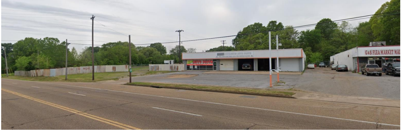
2555 Elvis Presley Blvd. Memphis, TN 38106